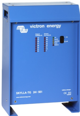
Skylla Charger 24 V 50 A