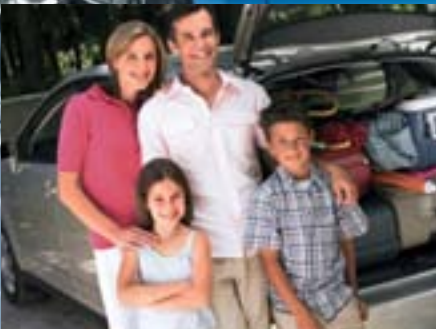
Powerful start to every destination