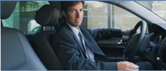
Specific safety for ambitious customers

Increased cold-starting power, increased power reserve, increased safety: In the luxury class, the dependable supply of electrical extra features is an important factor in the choice of batteries. The Bosch Battery S5 is especially suitable for new cars in this class, as it fulfils the manufacturers' sophisticated recommendations concerning original equipment and often even surpasses them. Silver Technology and reserve capacity increase the service life of the batteries significantly.