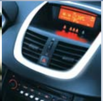
Radio and instrument display