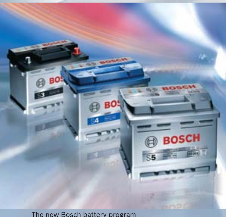
The new Bosch battery program