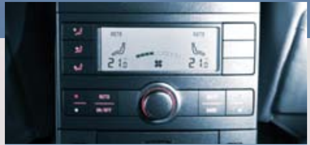
Display-supported setting for seat heating