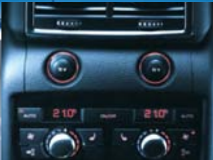
Electrical seat heating in rear