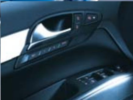
Power windows and mirrors