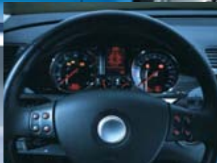
Cockpit and steering wheel electronics